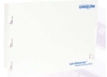
UniHome™ Network Box UHB-2VDT-KIT